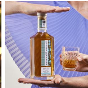
The creative vanguard of the Irish whiskey revolution