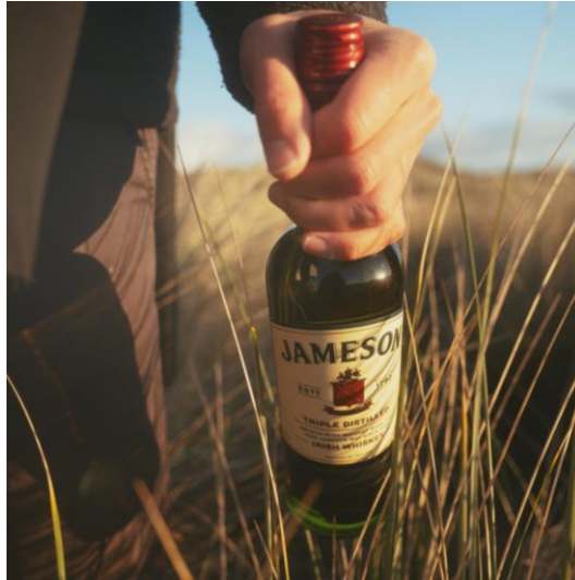
The world's most awarded & bestselling Irish whiskey*