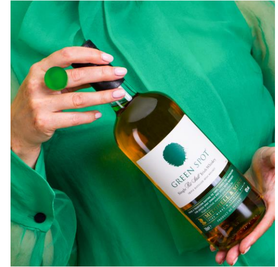
The cult classic Irish whiskey brand, influenced by wine casks for a colourful taste