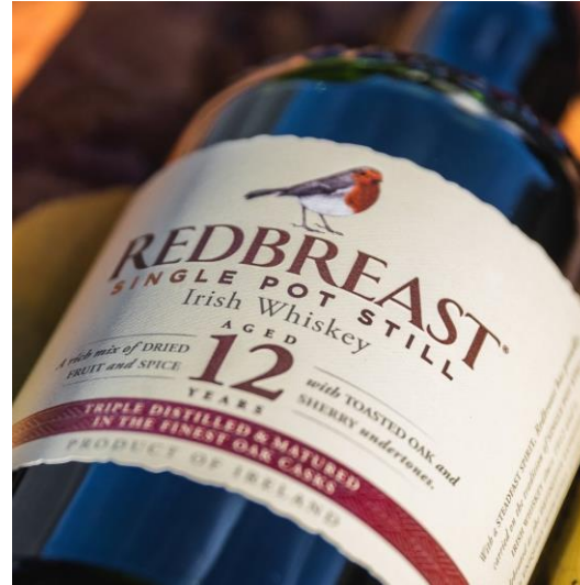
The definitive expression of single pot still Irish whiskey