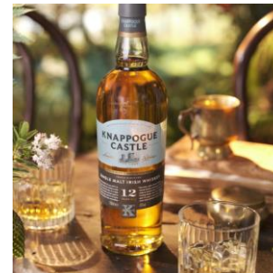
THE single malt from Ireland