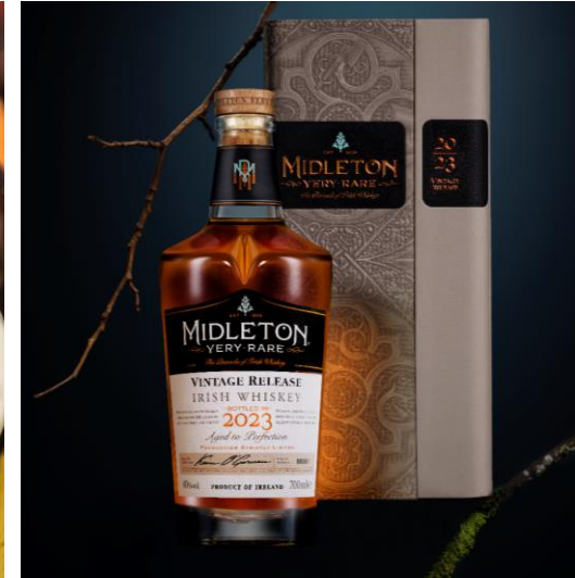
THE luxury Irish whiskey