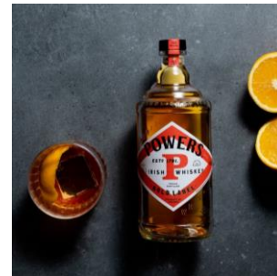
The quintessential Irish whiskey since 1791